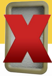
Ugly Yellowed Window